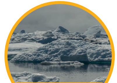
melting sea ice

To look at all the planning resources linked to The Environment, click here .